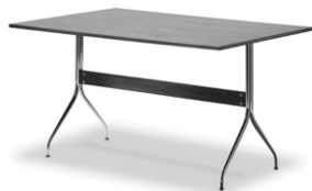
rectangular dining table