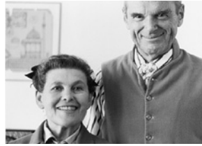
Designers: Charles and Ray Eames