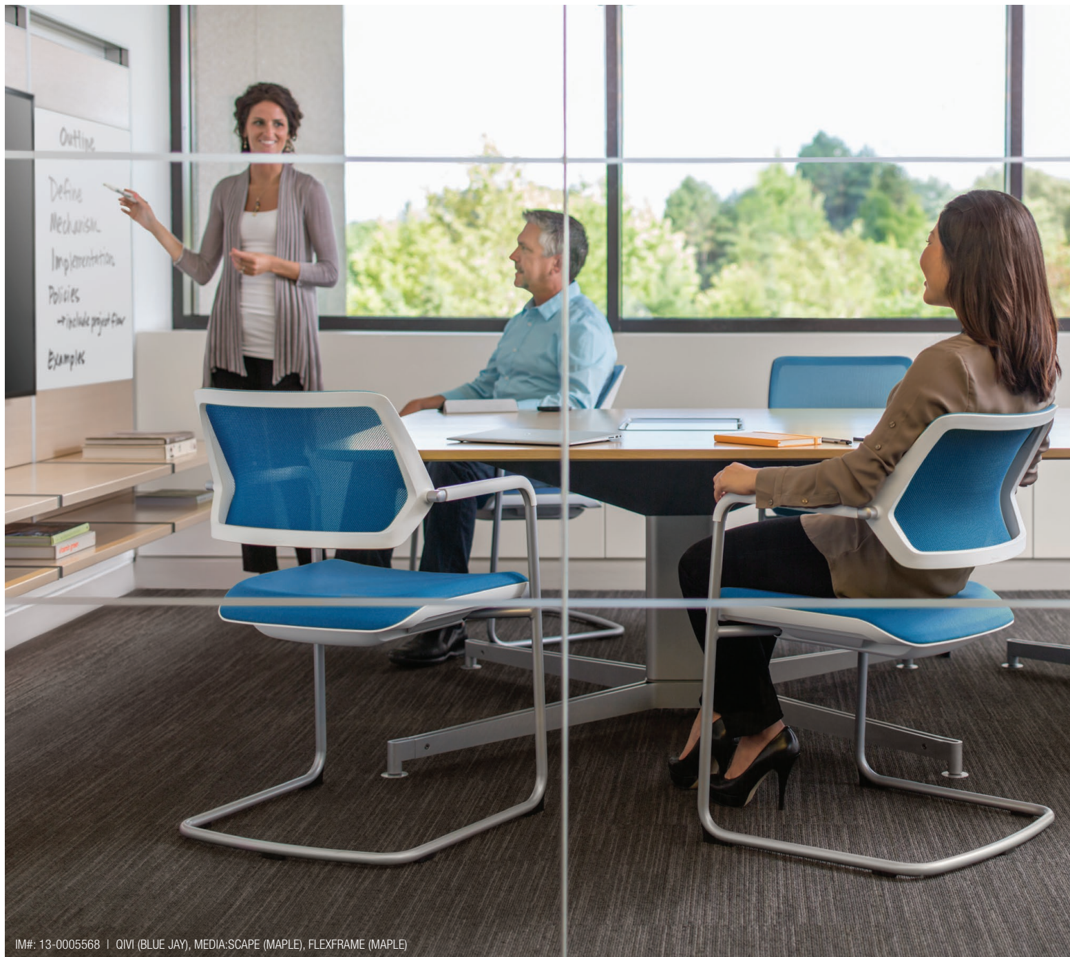
IM#: 13-0005568 | QIVI (BLUE JAY), MEDIA:SCAPE (MAPLE), FLEXFRAME (MAPLE)