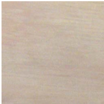
914 SANDED (NO STAIN/SEALERS)