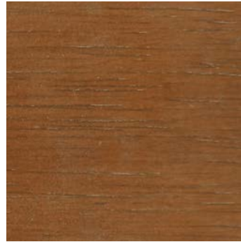
908 DARK BROWN