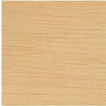
900 NATURE BEECH

Wood parts and laminated bases can be delivered in a wide range of colors and finishes. From rich Espresso to natural and more contemporary colors. Please note that all colors are not available on all models and some special order circumstances may apply.