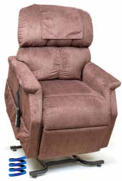
PR-505 shown in Palomino Available in Junior Petite, Small, Medium, and Large

The Relaxer is the original MaxiComfort<sup>®</sup> model and is available in medium and large sizes. Each pillow on its waterfall back features a zipper to allow you to remove or add the exact amount of synthetic polyester fiber fill to your liking, making every Relaxer a customized comfort experience!