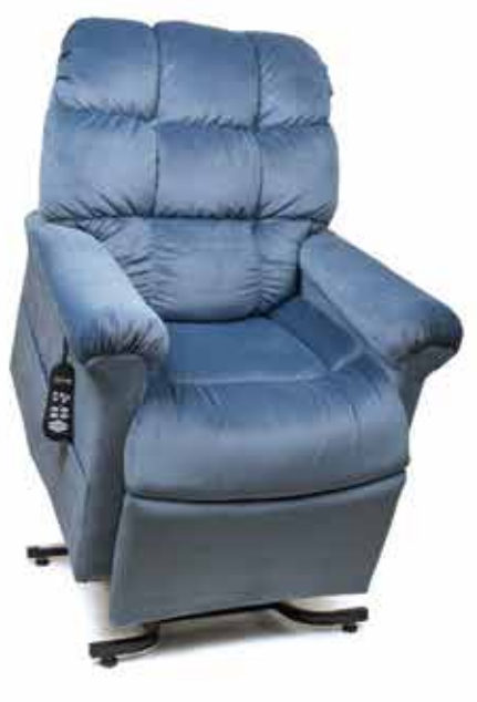
PR-510 shown in Calypso Available in Small/Medium and Medium/Large

The Cloud is now available in TWO sizes! The new Cloud PR510-SME is a small/medium sized chair designed to fit people 5'1" to 5'6". It features the same bucket seat and oversized. biscuit style backrest for the right amount of support. The original Cloud is recommended for people 5'7" to 6'4".