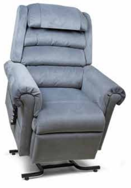
PR-756L shown in Sterling Available in Medium and Large

Experience the supportive comfort of 49 pocketed coil seat springs in the Cirrus. Each spring glides up or down independently to give your body unmatched seat support. The Cirrus is available in Medium which fits people 5'4" to 5'10".