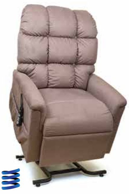
PR-508 shown in Pearl Available in Medium

The Cloud is now available in TWO sizes! The new Cloud PR510-SME is a small/medium sized chair designed to fit people 5'1" to 5'6". It features the same bucket seat and oversized. biscuit style backrest for the right amount of support. The original Cloud is recommended for people 5'7" to 6'4".