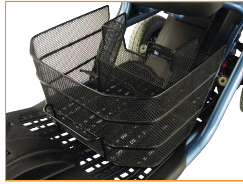
The unique under-seat basket provides a large cargo area that's safe and secure.