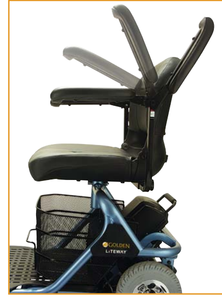
The Liteway comes standard with a plush, comfortable, seat and flip-up armrests for easy transfers.