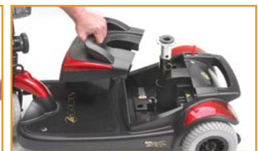
Step 2: Pull off the battery pack!