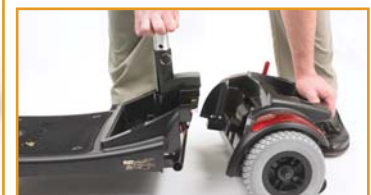
Step 3: Push apart the frame!