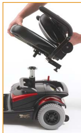
Step 1: Pop off the seat!