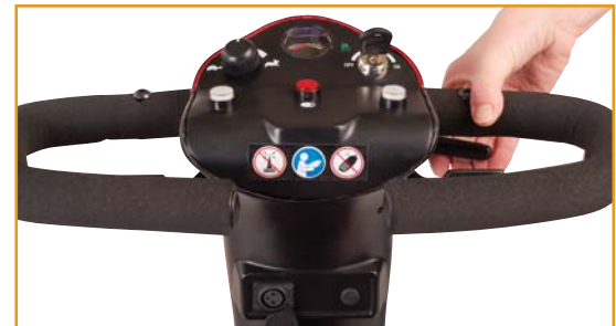
EZ Reach tiller adjustment