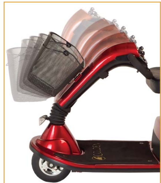
Patented infinite adjustable tiller