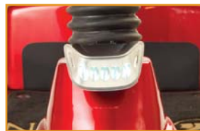
Angle adjustable LED headlight creates a wide path of bright light