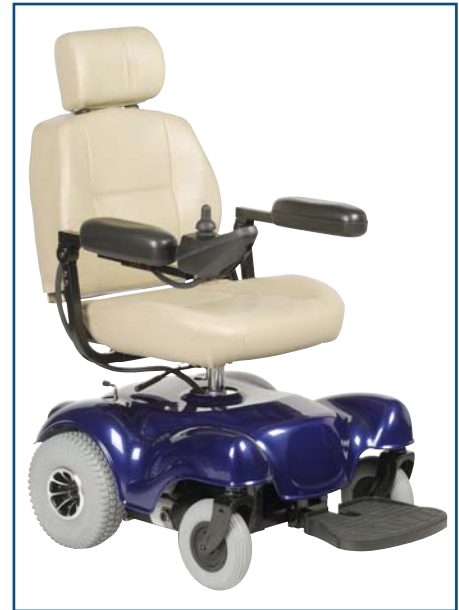
Captain's seat also available for a limited time.