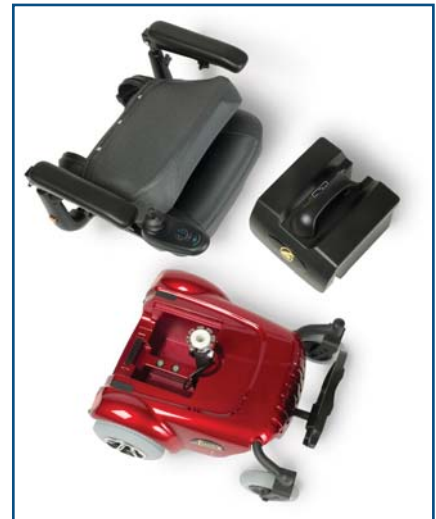
Disassembles quickly and easily into three pieces!