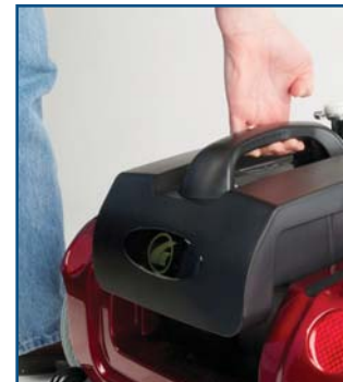
Unique trigger release for easy battery pack removal